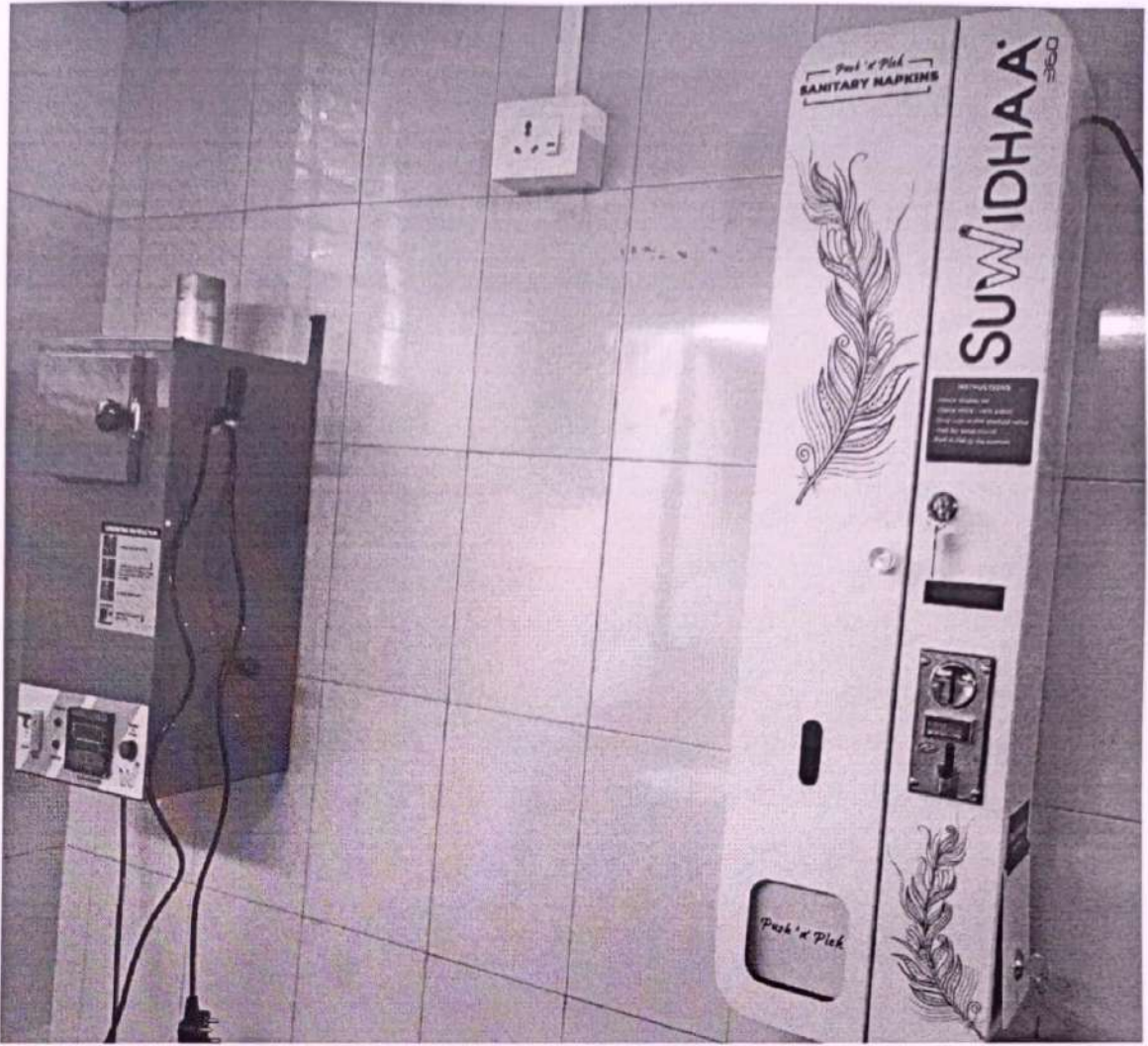
PSA presented four sanitary pad vending machines and also incinerators for the girl student's toilets