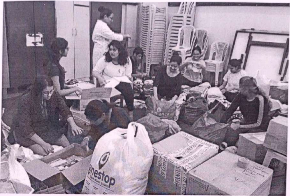
PSA conducted a fund raising drive for people affected by floods in Kerala