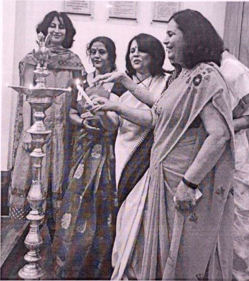
Department of Statistics in collaboration with PSA organized National seminar on “Understanding clinical trials and role of statistics in clinical trials”