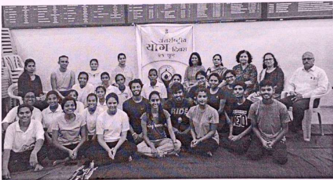
PSA collaborated with the Department of Philosophy to celebrate International Yoga Day